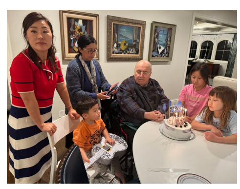
Gathered round the cake at my son's house as we celebrate my 83rd birthday.