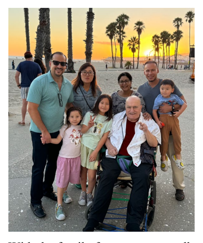
With the family for a summer walk at the Santa Monica Beach.